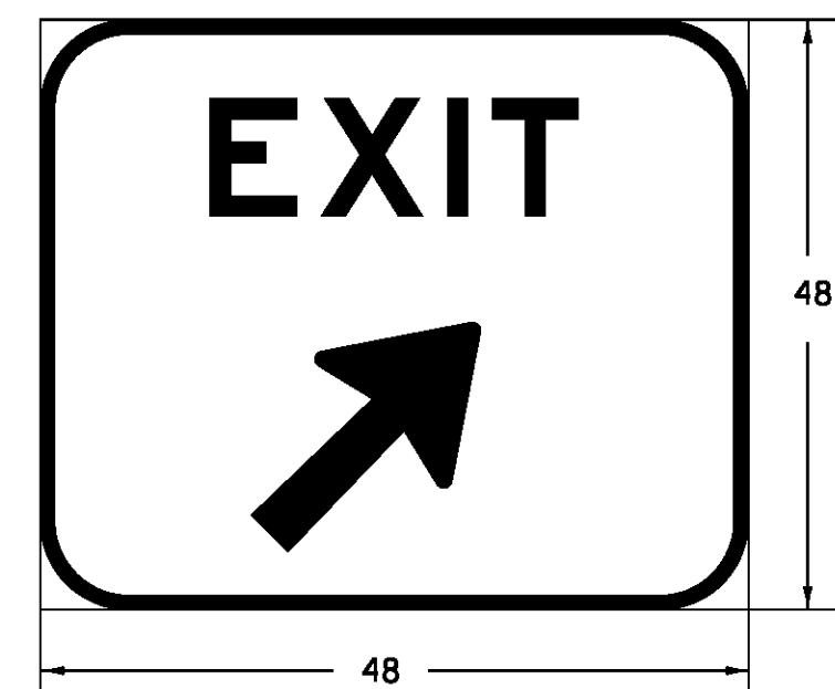
SEE TYPICAL APPLICATION 42 MUTCD 2009 (REV.)

PCMS=PORTABLE CHANGEABLE MESSAGE SIGNS = DIRECTION OF TRAVEL