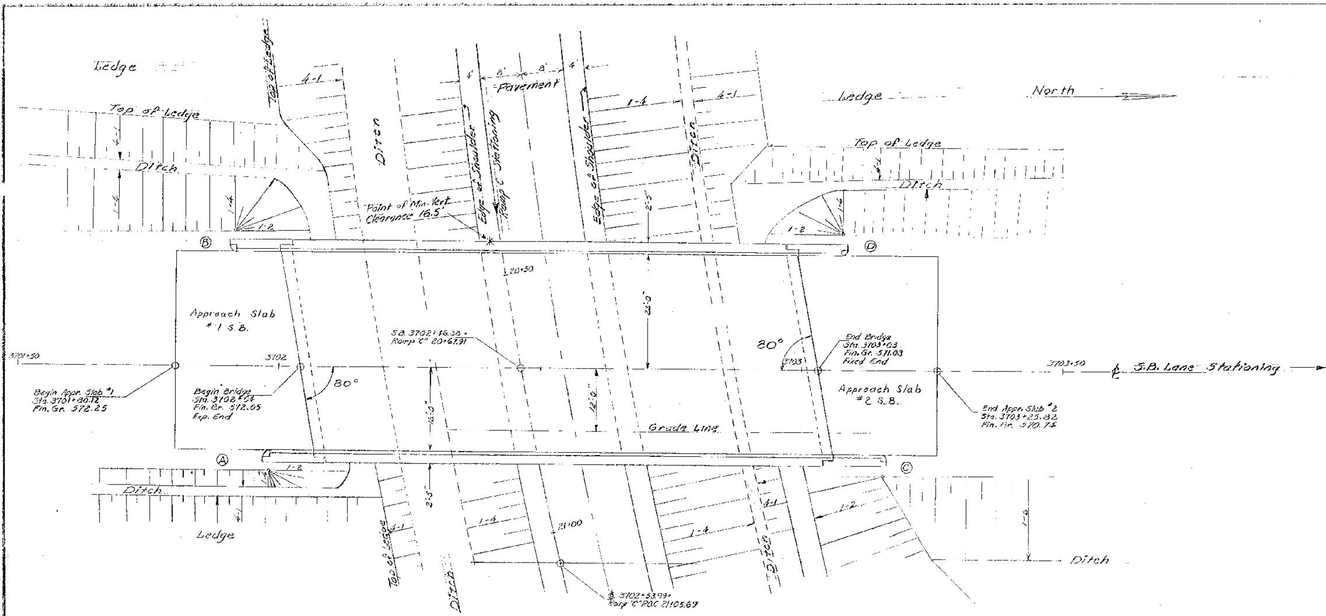
PLAN SCALE 1" = 10'

Note: See Std. Dwg. G-3a For Dead End Anchorage of Bridge Approach. (Typical Both Ends).