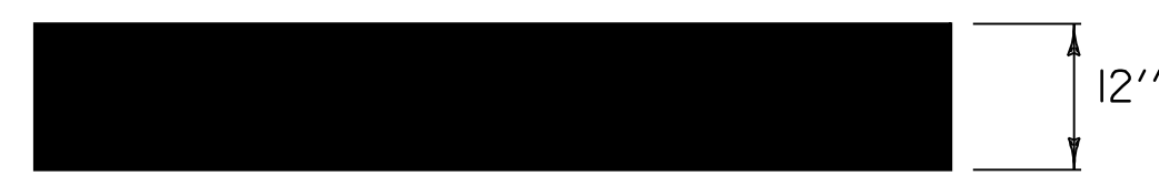
CHANNELIZING LINE (WHITE)