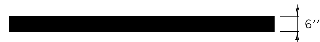
SOLID LINE (WHITE OR YELLOW)