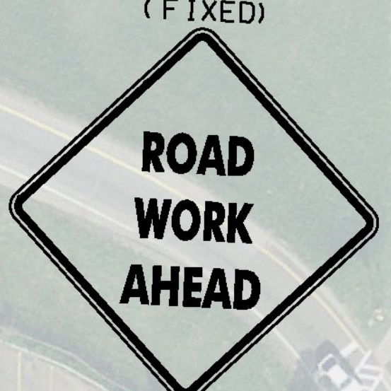
(FIXED) W20-1A MM 88.70 NB ON-RAMP