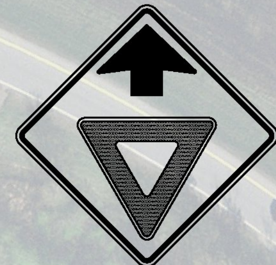
W3-2A (SPACED EVENLY ON RAMP)