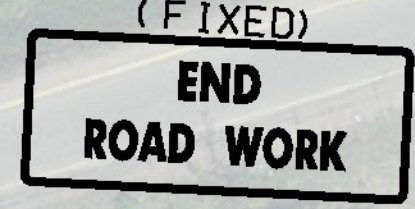
(FIXED) G20-2A MM 88.79 NB OFF-RAMP