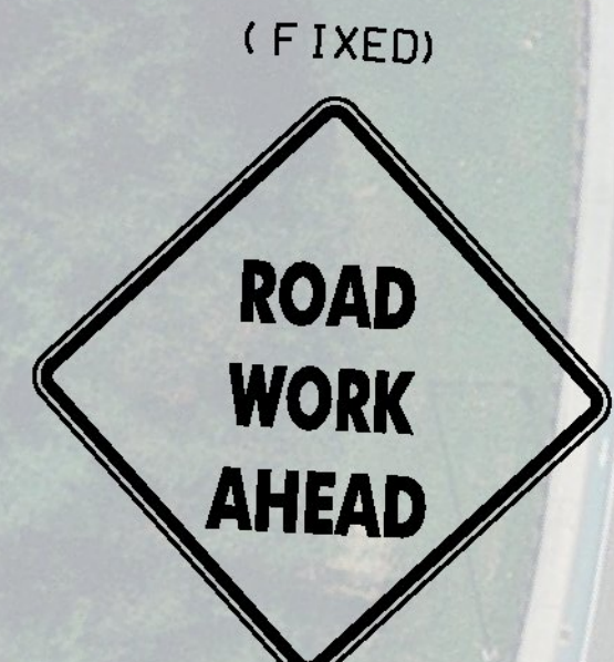
(FIXED) W20-1A MM 88.70 NB ON-RAMP