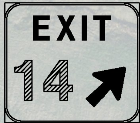
E5-1A MM 88.72 NORTHBOUND