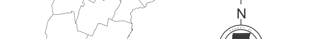
EAST BETHEL INSET 2 SCALE 1:12672