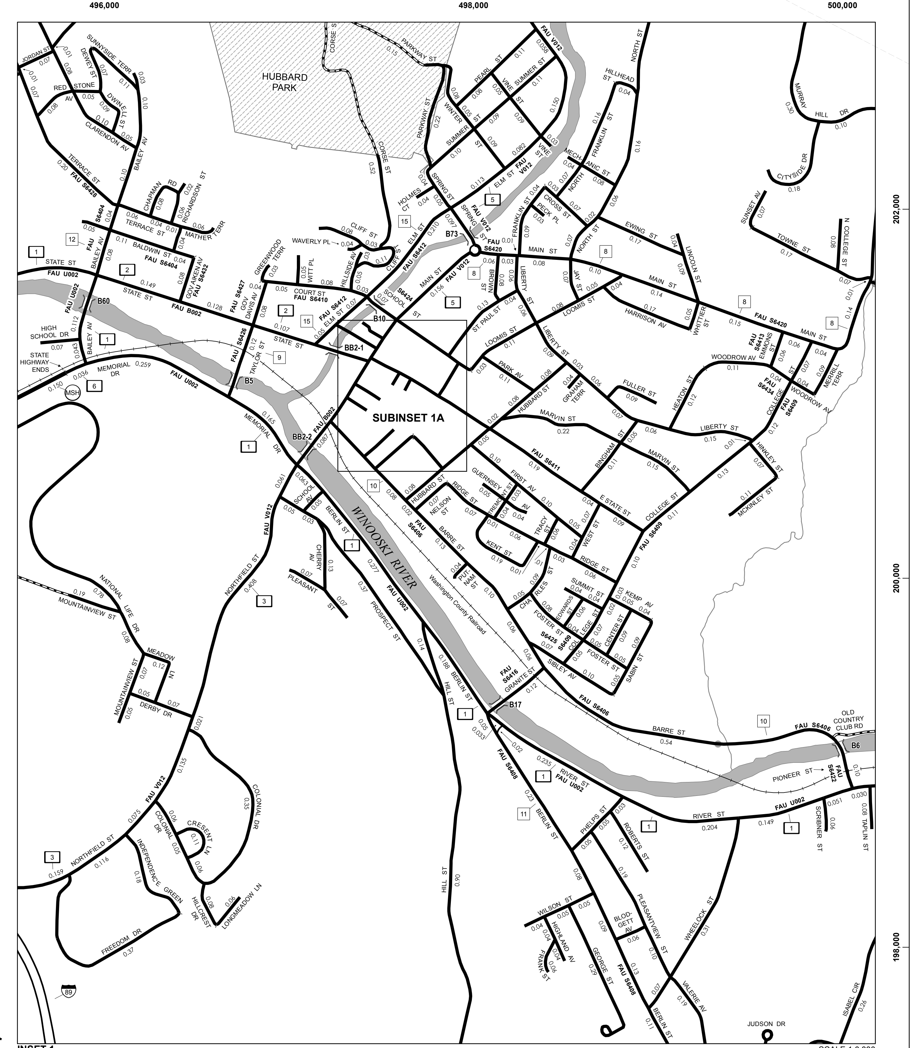
INSET 1 SCALE 1:6,336

DISCLAIMER: The untraveled highways (laid-out town highways), discontinued highways, and legal trails hereon are those of which the Agency of Transportation has record; others may exist. Highway and bridge data by the Agency of Transportation. Town short structures are drawn from the Vermont Online Bridge & Culvert Inventory Tool (VOBCIT) database. All other data from the Vermont Center for Geographic Information. Only named streams are shown. Vermont State Plane Coordinate System North American Datum of 1983 SPCS, Zone Identifier: 4400 Geodetic Reference System 80 2,000-meter grid, Easting - Northing