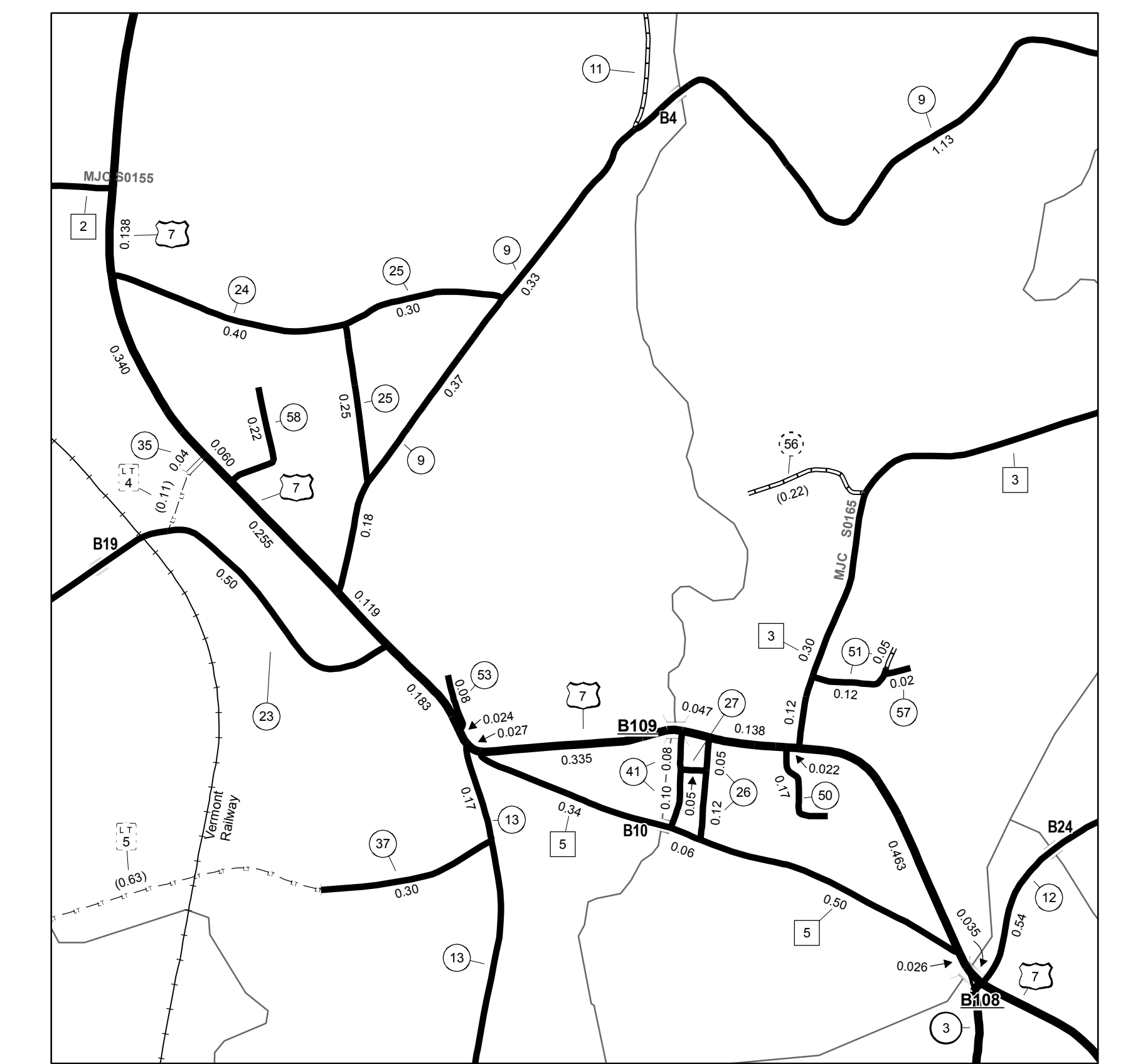
PITTSFORD INSET 1 SCALE 1:12672