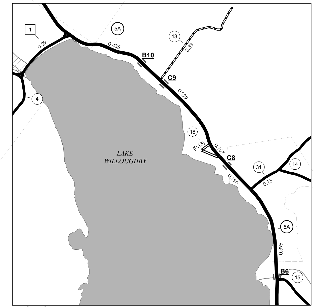
WESTMORE INSET 1 SCALE 1:12,672 0 0.15 0.3 Miles