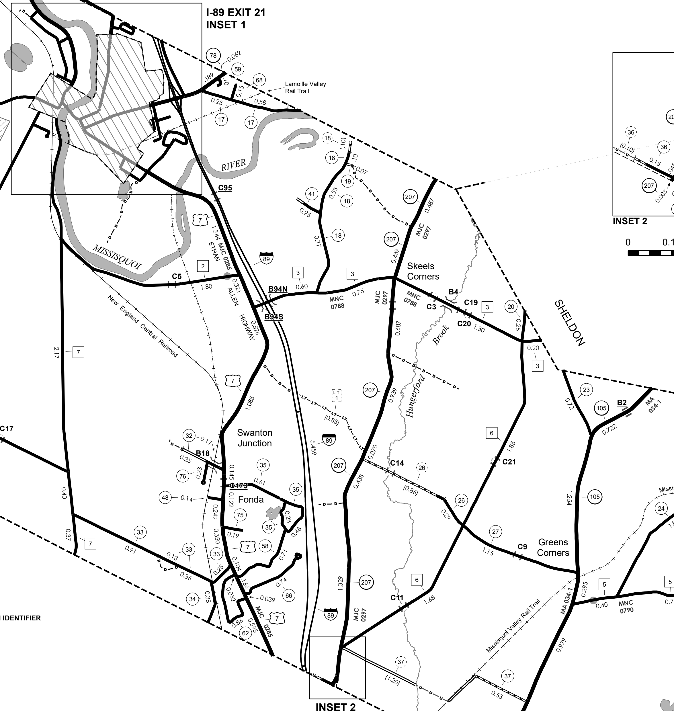
INSET 2 SCALE 1:12,000