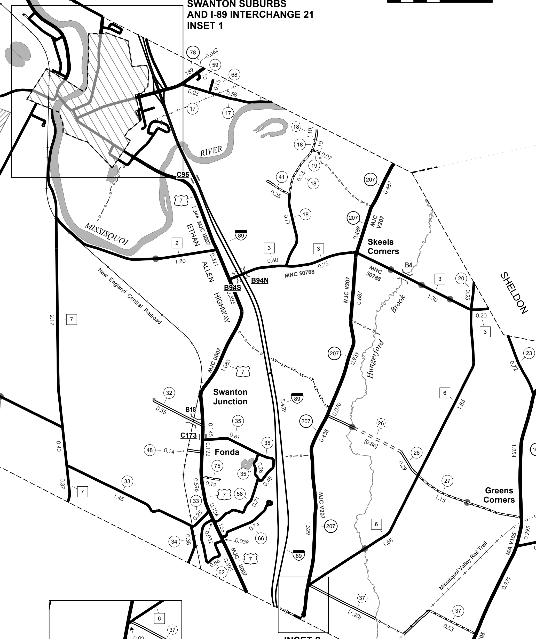
SWANTON SUBURBS AND I-89 INTERCHANGE 21 INSET 2

SCALE FOR INSETS 1:12,000 0 0.2 0.4 Miles